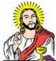
Red Thread .....

OT prophets – knew about Christ. E.g. Isaiah 7.14